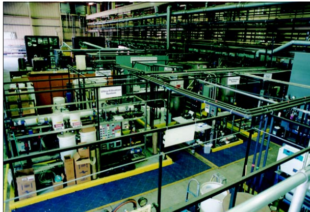
Package Plant Area

National Risk Management Research Laboratory, Water Supply and Water Resources Division, Water Quality Management Branch,