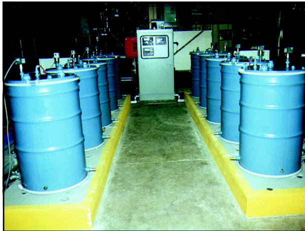
Bench-scale compost reactor system

agents and placed in a compost reactor (or a compost pile) for a specified period of time. Oxygen is supplied to the compost through a system of piping that either forces air into the compost (a positive-pressure system) or pulls air through the compost (a negative-pressure system). Various species of bacteria in the compost utilize the available carbon sources and, in the process, biodegrade the organic contaminants.