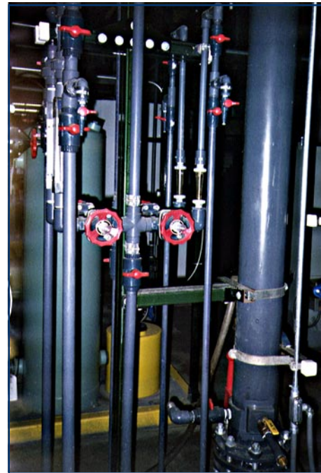
Sampling Assembly and Other Components of the Dead-End Pipe System

During a test, the chlorine concentration of the feed tank is set in the range of 0.1 to 50 mg/L (as free chlorine). The flow rate through the system is set in the range of 0 to 20 gallons per minute (gpm). The duration of each test is commonly one to four weeks. A series of tests are typically conducted sequentially by varying the flow rate through the pipe at a constant free chlorine concentration. The biofilms that grow on the main pipe wall during simulated test conditions are sampled using "coupons". Coupons are circular metallic pieces attached to metal rods that are inserted through several openings (coupon ports) in an individual pipe wall. These coupons, once inserted properly in the coupon port, are flush with the inside wall of the pipe. After completing a study (or during a study), these coupons are removed and the biofilm is analyzed to evaluate the biofilm accumulation under different experimental conditions.