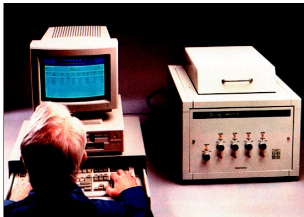
Automated Respirometer Unit (N-CON)